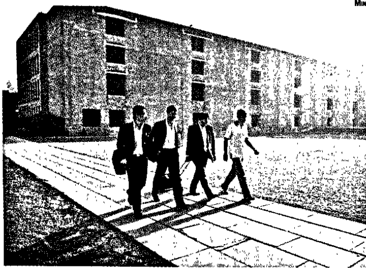
Differing views: A file photo of IIM-Ahmedabad. IIM-A's governing council chairman says that IIMs should be given an option on whether they want to join the council.

The IIMs provide postgraduate diplomas in management (PGDM) to their students and many IIMs say this is not well-accepted internationally. Other than the council, the draft